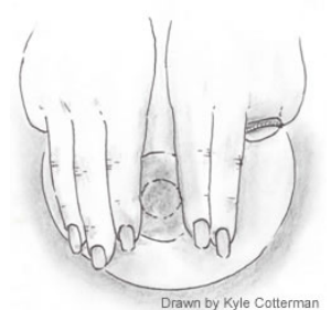
Two handed, two-step method Using 2 or 3 straight fingers on each side, first knuckles touching nipple. Move ¼ turn. Repeat above & below nipple.