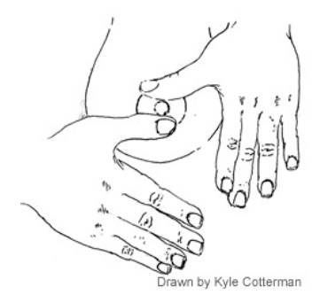
(Step 2). Move ¼ turn. Repeat above & below nipple.

Hand expression — Hand expression of milk between feedings may be necessary to avoid engorgement. Milk ducts open in several areas on the nipple; after let-down, milk should squirt easily from multiple openings when you gently push the area behind the nipple. There are a number of techniques to express milk by hand.